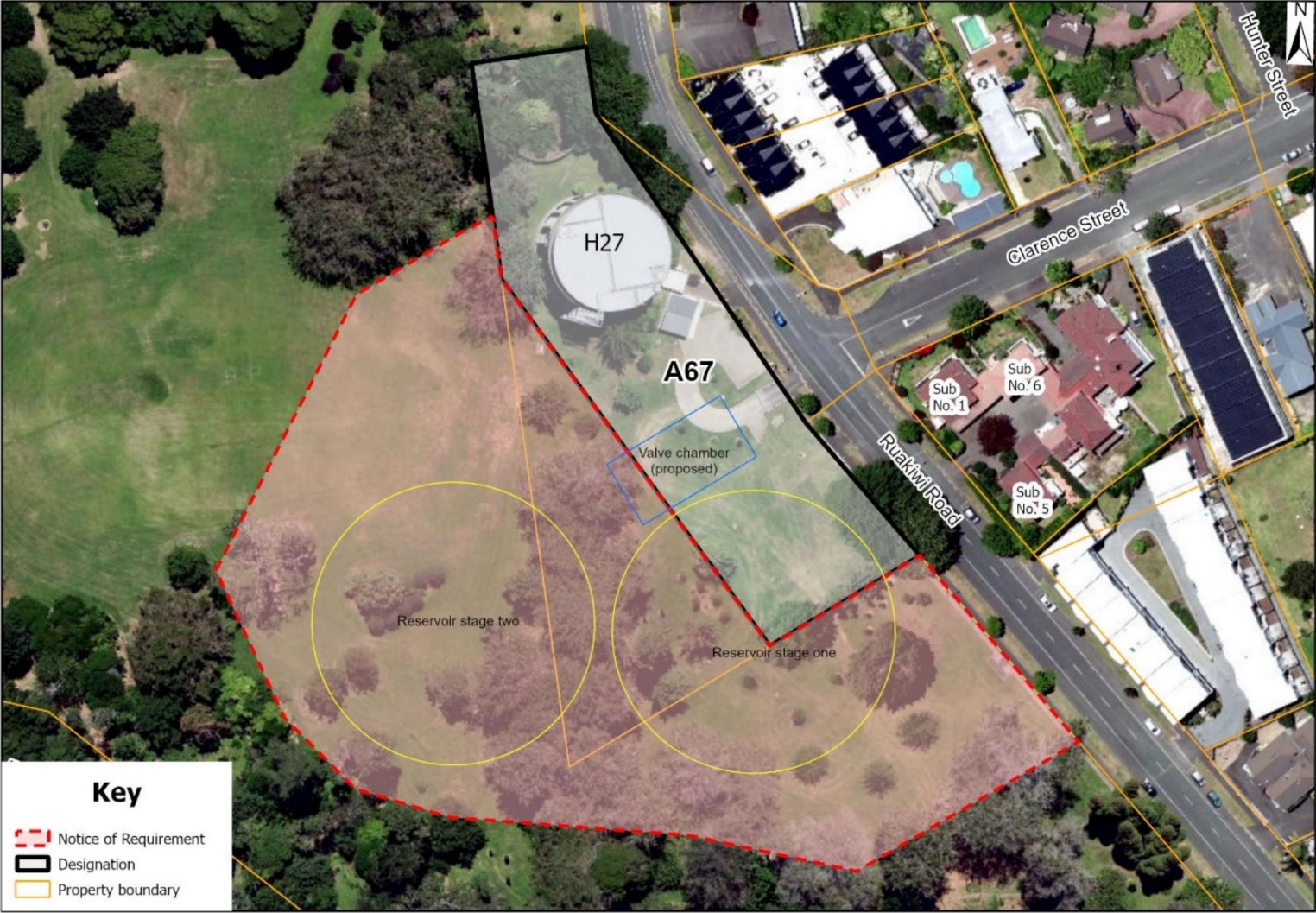
Figure 1: Designation Areas Plan View and Submitters